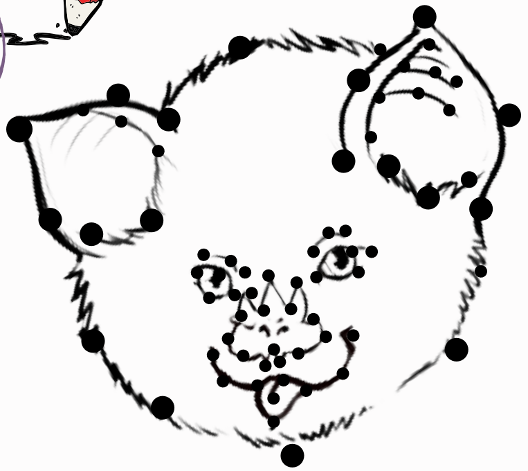
Percival's short-eared trident bat