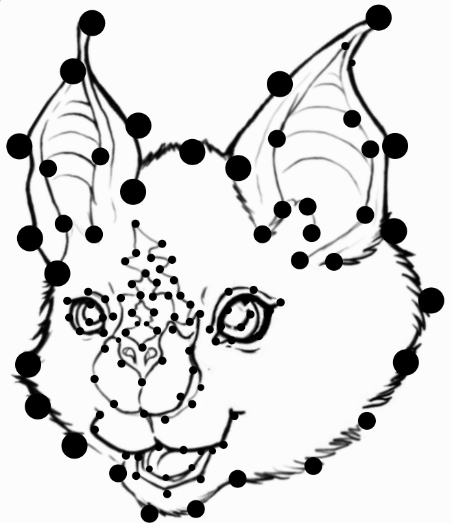
Geoffroy's horseshoe bat